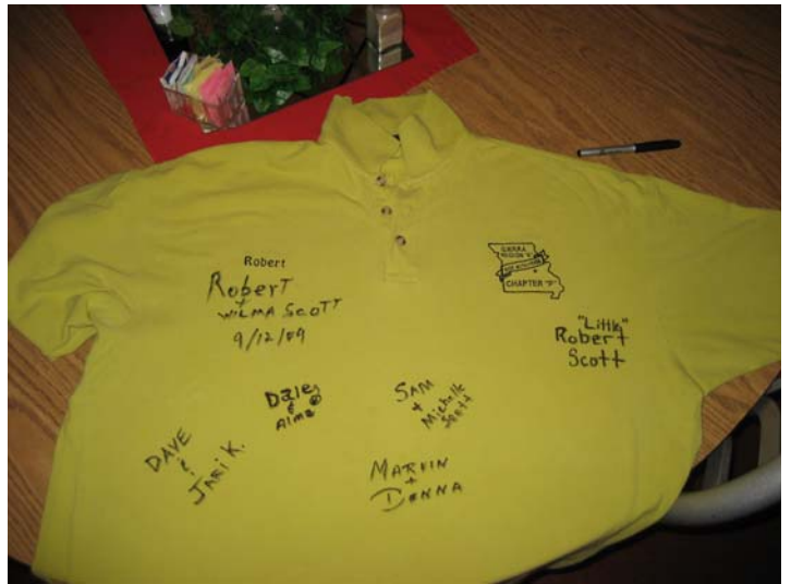
When at the Hub, add your name to this shirt