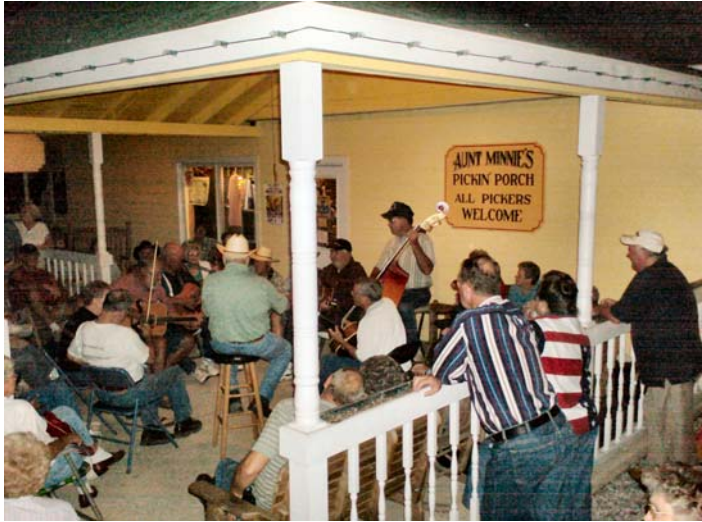
Mt View Music Entertainment