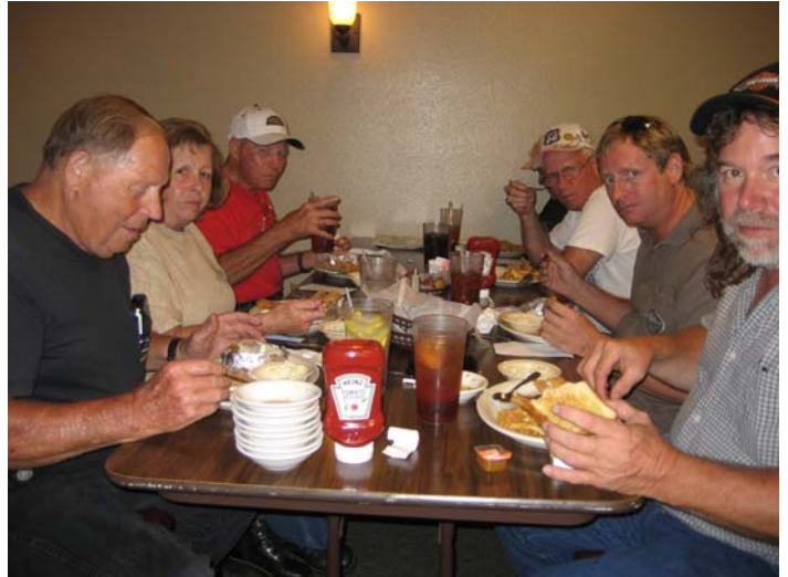
Umm good- at JoJo's Catfish Wharf