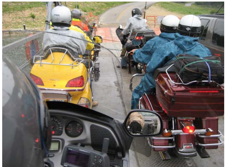
Departing Ferry-Notice Raingear