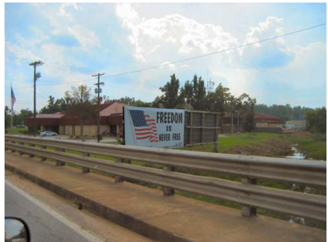
9/11 reminder Freedom is not Free