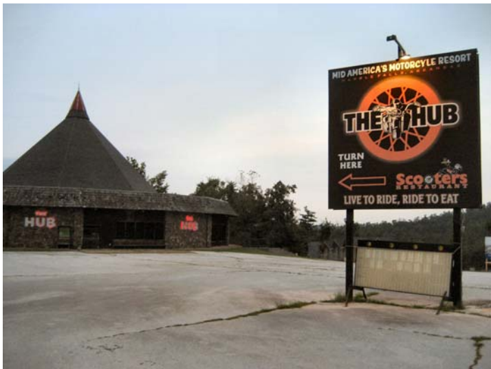
Live to Ride- Ride to Eat (good motto)