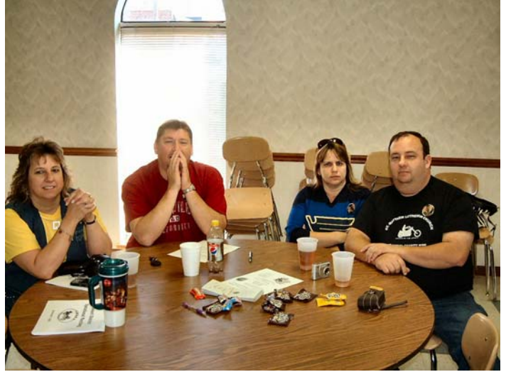
-- Dawsons & Scotts at Versailles meeting