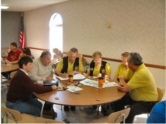
Chapter P: Housers, Wahles & Blacks --