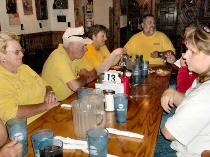
Klines after Central Dairy??