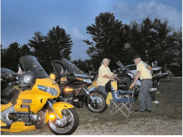
Cuba 19 Drive-in