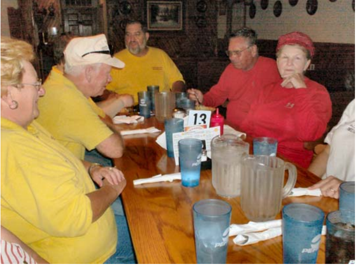
Hot - but not too hot to eat