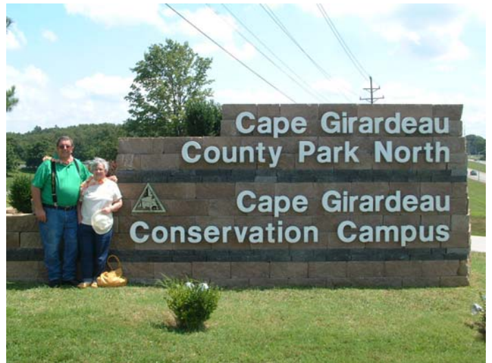
Scotts enjoy the day