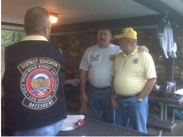
Dawsons went to Chap L Kickoff -Stockton