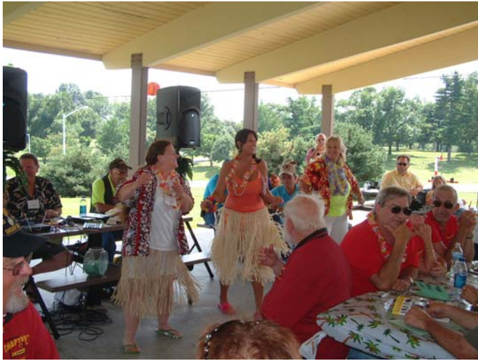
A little Hula for the occasion