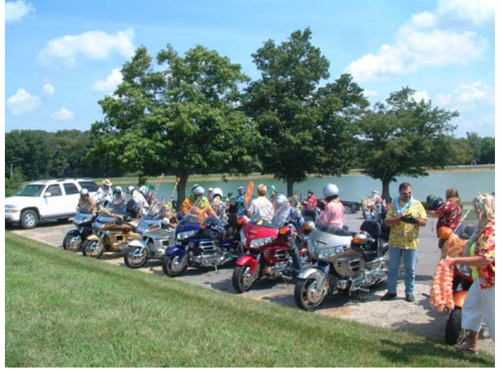
Bikes arrive at Chap I Poker Run